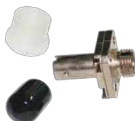
FC-ST Singlemode Simplex Adapter

An optical fiber adapter or uniter is used to mate two connectors together, usually mounted in a distribution panel or wall box.