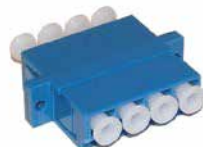
LC Singlemode Quad Adapter