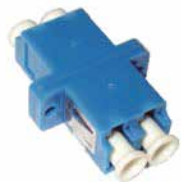
LC Singlemode Duplex Adapter