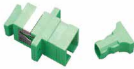
SC/APC Singlemode Simplex Adapter