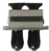
SC-ST Multimode Duplex Adapter